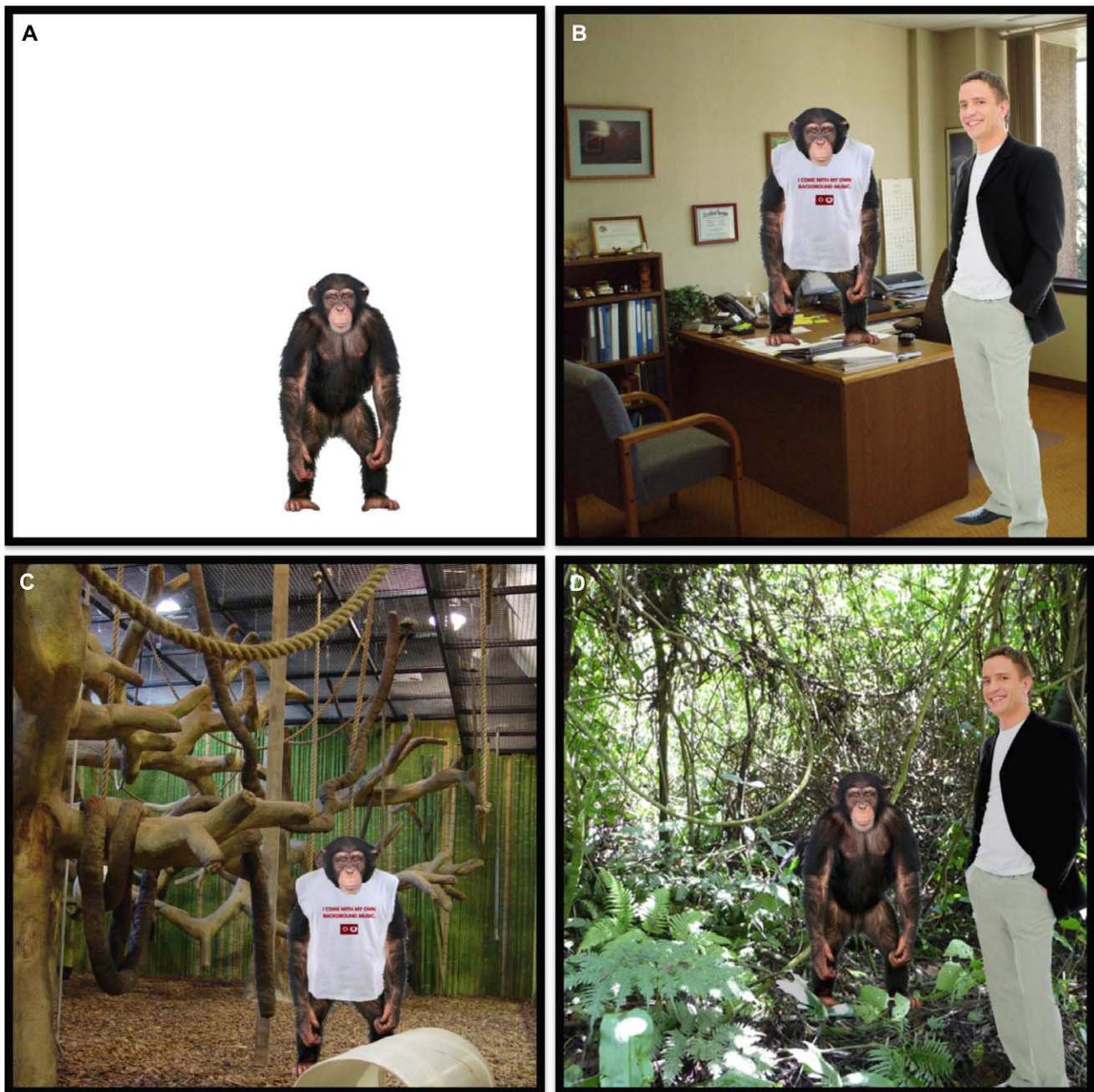
Figure 1. Sample images provided to survey respondents. Detailed legend: Each image was characterized by four variables: clothing (two levels: clothed and unclad), human presence (two levels: human present, no human present), setting (four levels: a blank, neutral background, an anthropomorphic setting which depicted a typical office setting, a modern zoo setting in which artificial exhibit elements and wire mesh caging were visible, and a naturalistic, jungle background), and media (three levels: photograph, cartoon, pencil line drawing). The images above are a sample of the 48 unique images used. (A) chimpanzee unclad with no human with a neutral background. (B) chimpanzee clothed with a human in an anthropomorphic setting (typical office space). (C) chimpanzee clothed without a human present in a captive setting. (D) chimpanzee unclad with a human present in a species-typical (jungle) setting. doi:10.1371/journal.pone.0022050.g001

D) shows four sample images which illustrate key combinations of these variables.